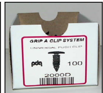
Photo of Gripper Drawer shown above.

Each "Grip a Clip" item is packaged in a heavy duty corrugated drawer with photo and description of each item (exact size). Easy to re-order and replace.